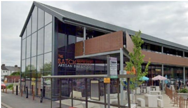
The Batch House (Opposite the stadium)

Car Park Entrance What3words: blows.single.glory