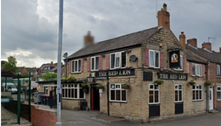
The Red Lion (Whittington Moor)

There are several pubs and restaurants near the SMH Group Stadium to suit a variety of preferences: